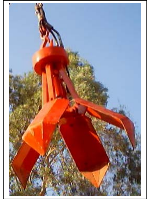
Jetting Catch Basin truck with optional Mechanical cable For sewer cleaning system operated from the Truck powerful engine.