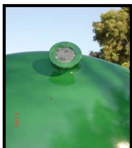
level indicator glass