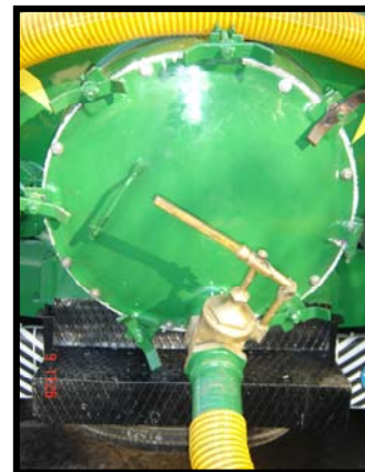
Standard suction truck with optional Mechanical cable for sewer cleaning system operated from the Truck powerful engine.