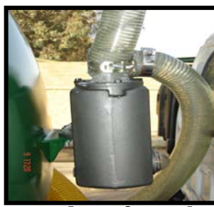
secondary safety valve