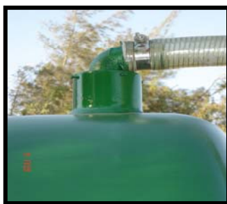
primary safety Valve